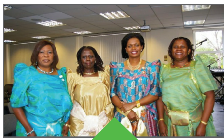
Nabagereka Sylvia Nagginda of Buganda 2nd from the right side

Launch of the Nnabagereka Development Foundation, 28 July 2011.